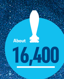
Rocket/mortar/ anti-tank fire