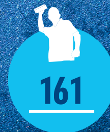
Throwing objects/ arson/tire burning